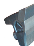
Tooth type Viper