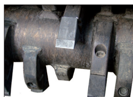
Rotor type Viper