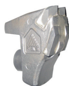
Tooth type C/SD