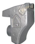
Tooth type C