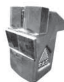
Tooth type STC/SD