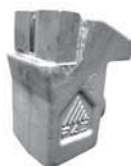
Tooth type STC