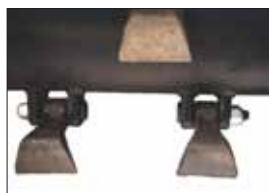
Rotor with PMM/SSL hammers

The data refers to the machine without options.