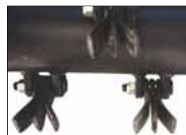
Rotor with "Y" flails