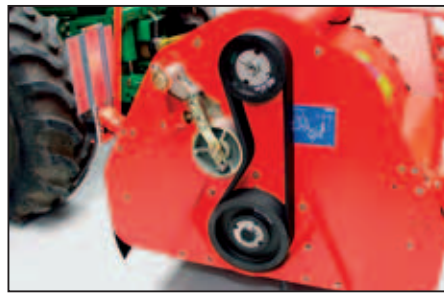
More peace of mind: automatic V-belt tensioning (KS 75-2, KSA 75-2 and KS 75-4)

a greatly reduced haulm intake during harvest, secondly improved harvest quality and last but not least increased output.