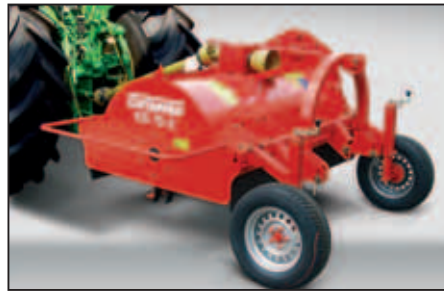
Perfect solution: conversion between front and rear mounting