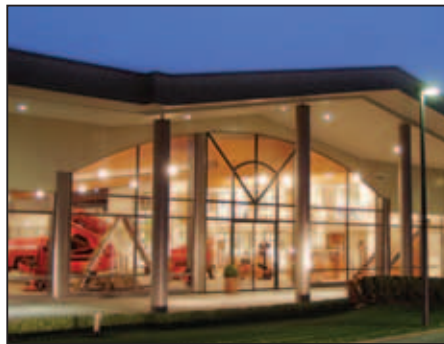
2000 m 2 of know-how: the Grimme training and exhibition centre TECHNICOM