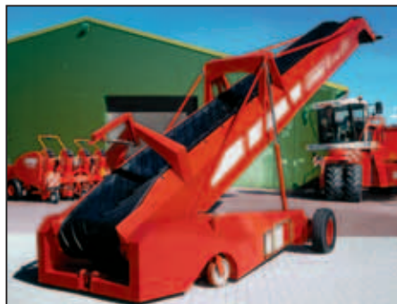
Innovation for more than 70 years: Grimme potato technology