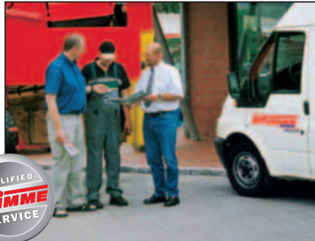
A three-way partnership: Grimme dealer, operator and Grimme employee

What is the result when all the experience gained over more than 70 years of potato harvesting technology is applied to the development of separating, planting, cultivation, harvest and storage technology? The answer is quite simple: More! – More successful harvesting! Our innovative technology is further enhanced by our after-sales service. Highly qualified employees use the Grimme TECHNICOM (training and exhibition hall) to train our dealers and service partners from over 60 countries. After successfully completing their training they are ready to provide users with original Grimme spare parts and competent advice with certified 24 hours a day, 7 days a week service; and anywhere in the world. The results of this three-way partnership: Grimme dealer, operator and Grimme employee are visible every day. We benefit from your practical experience – and can use that experience to create practical solutions – as we did for the development of the new haulm topper series. You profit from our technical know-how and thereby achieve – season by season – our common goal: Harvesting success!