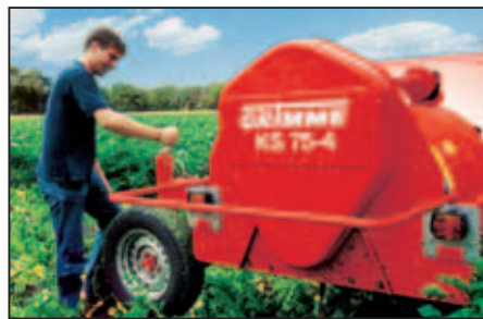
Better performance: Support wheels for height control and...