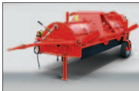
Convenient – even beyond the field: The optional end tow system for stress-free road transport.