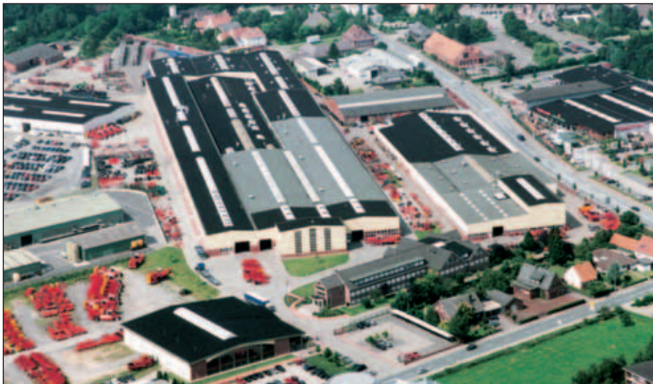
Location: Grimme belongs to Damme as the famous 'red' does to our machines.