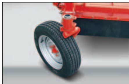
...castoring wheels available as an option.